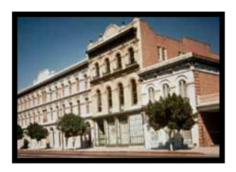
Theater A building that actors and performers use to put on a show. This was a popular entertainment especially in the 1870s.

Leisure: Things people find entertaining or do for fun.