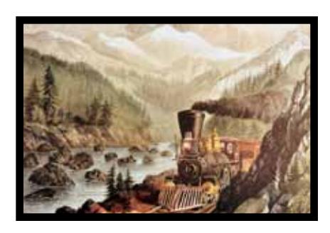
Train A popular form of transportation in the 1870s for people and goods.

Transportation: The movement of people or goods from one place to another.