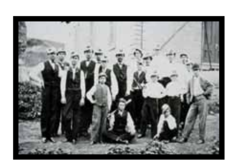
Baseball A sport that became popular during the 1870s.

Buildings: A structure that people may live or work in.