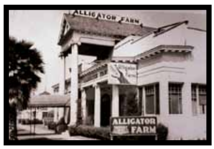
Tourism A trip to a place for business, pleasure, or interest. This became a popular leisure activity in the 1920s.

Buildings: A structure that people may live or work in.