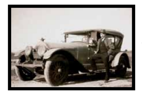
Car A popular form of transportation in the 1920s.

Transportation: The movement of people or goods from one place to another.