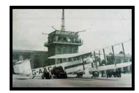
Airplane A new form of transportation in the 1920s.

Leisure: Things people find entertaining or do for fun.