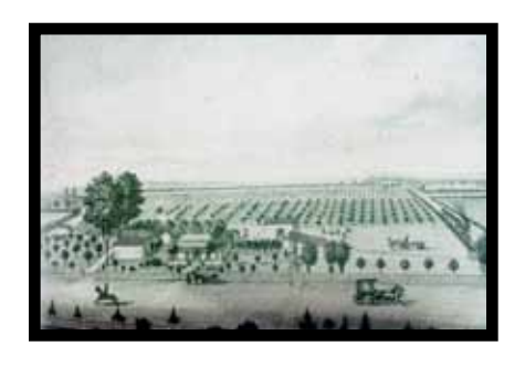
Agriculture The science and business of growing crops and raising livestock.

Work: Different types of businesses that people do for a living.