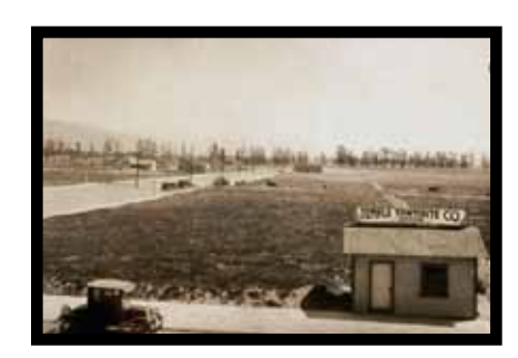
Real Estate The buying and selling of land and buildings. This was a popular business in the 1920s.

Work: Different types of businesses that people do for a living.