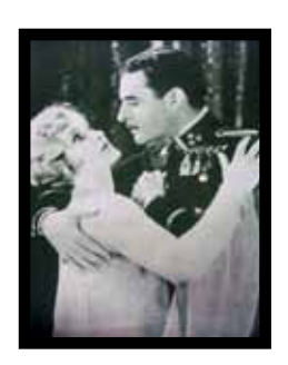
Silent Film A popular form of entertainment and business during the 1920s. It was a movie with no sound except music.