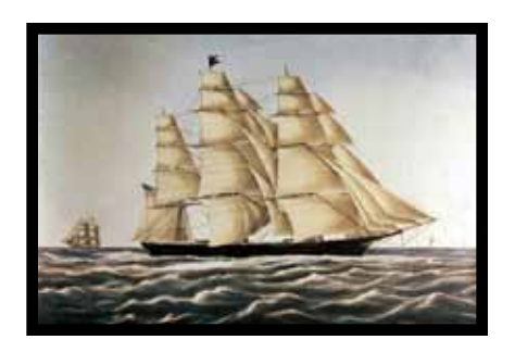
Ship A popular form of transportation in the 1840s for people and goods.

Transportation: The movement of people or goods from one place to another.